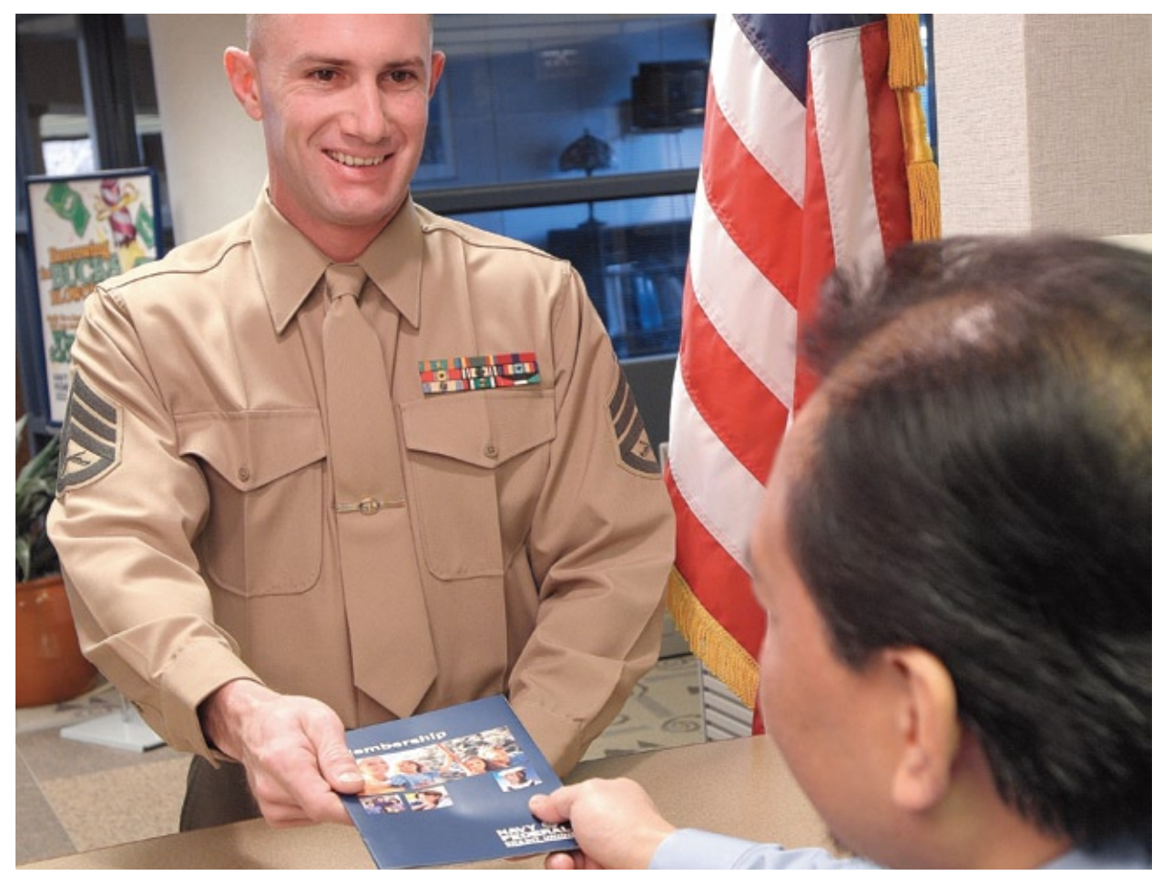
Navy Federal Credit Union, which serves United States military personnel worldwide, is one of the nation's 8,500 credit unions.