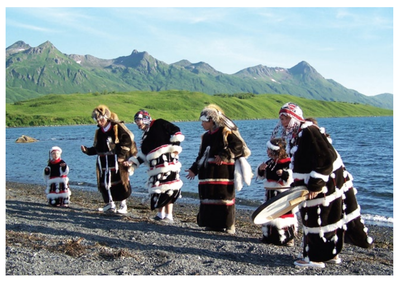
Attired in ceremonial dress, members of the Alutiiq tribe memorialize a community leader who helped bring electricity via Alaska Village Electric Cooperative to their Kodiak Island village.