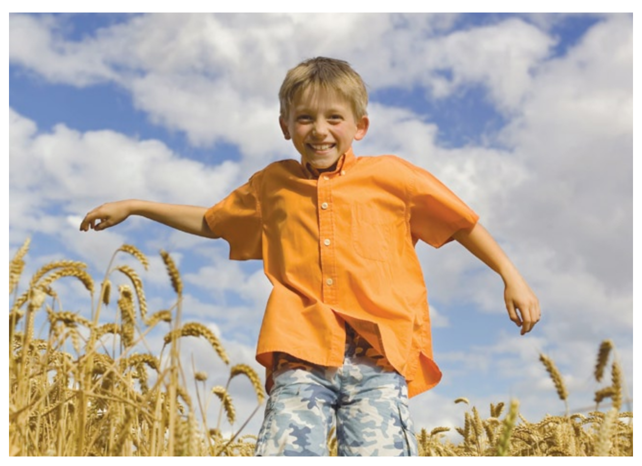
Students from preschool to middle school attend the nation's cooperative schools—educational institutions owned and governed by parents with the common goal of enriching the learning experience.