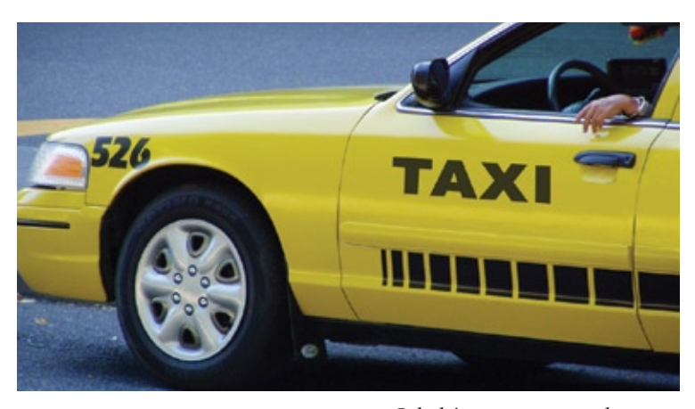
Cab drivers are among the diverse members of workerowned cooperatives in the United States.

With cooperatives making such a significant mark on the everyday lives of Americans, maybe it's time to revise that well-known jingle to: "Baseball, hot dogs, apple pie...and the co-op way!"